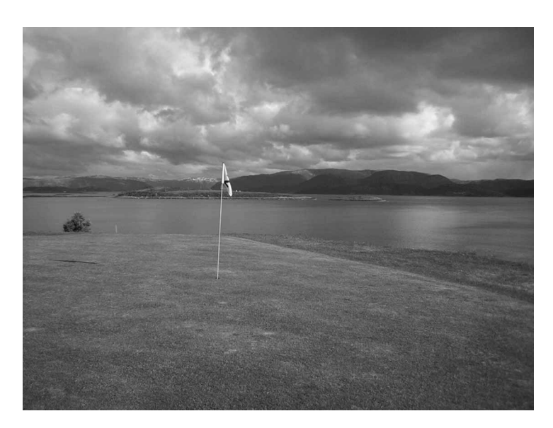
Figure 9. "We created something with our own bare hands."

conversely, that the informant disapproved of this particular land use. The year-round resident and teacher from Hitra-Frøya who took it, however, indicated that it represents a positive change that was accomplished by the voluntary association of local residents. According to her, "there were 5 of us, and...we started Hitra Golf Club...We created something with our own bare hands". The simple question, "why did you take this photograph?" initiated a discussion of community development, which eventually led to the participant disclosing her multifaceted frustration with rural living. This example not only reveals the thick data that PDPE can produce, but also underscores the vital role of pairing photo-based methods with interviews, since the meaning is dependent upon the photographer for interpretation.