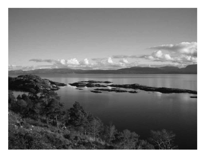
Figure 1. "Taking it slow, looking at nature."

Numerous participants presented photos of ordinary scenes, such as that captured in Figure 3 to represent the communal effort that goes into running and maintaining a local community – a common thread in this study. The Bayfield small business owner who took this photo, for instance, elaborated in the interview that "two years ago we redid (the) playground; it was about $150,000 of value... that cost the city only $10,000... all of the construction work was done voluntarily".