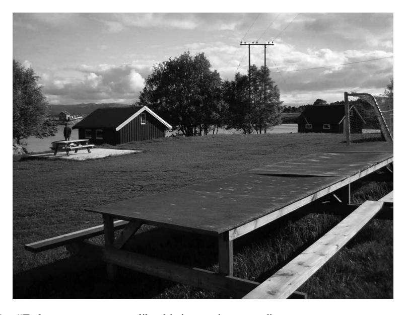
Figure 6. "To have common areas like this is very important."

As was expected, participants took many more photos of places they felt positively about, consistent with one of the identified shortcomings of the method (Stewart and