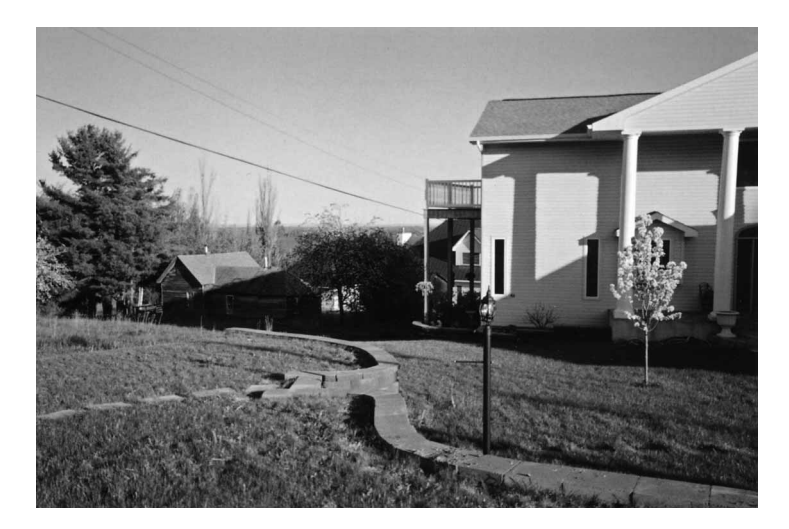
Figure 8. "Just shadowing these houses where people used to live."

This informant proceeded to explain the impact of new development on her bottom line, indicating that,