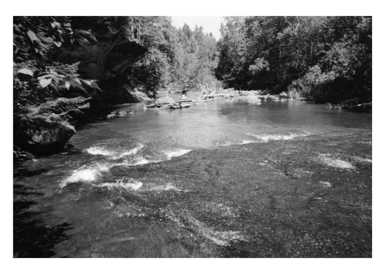
Figure 2. "One of my all-time favorite places."

This is another example of the multiple layers of meaning embedded in PDPE-produced data; the participant meant to highlight an important new amenity for his community, but in discussing the photo revealed that perhaps more important than the park itself was the social interaction and commitment to the locality embodied in the efforts to create it.