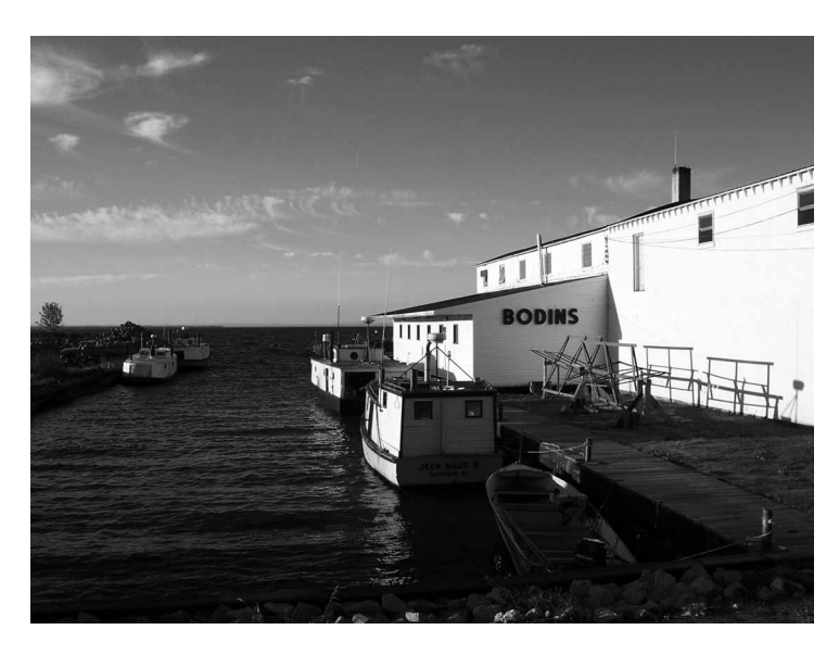
Figure 5. Example of the threatened traditional landscape.

everyday places and their social meanings can be neglected in traditional interviews in favour of more controversial subjects.