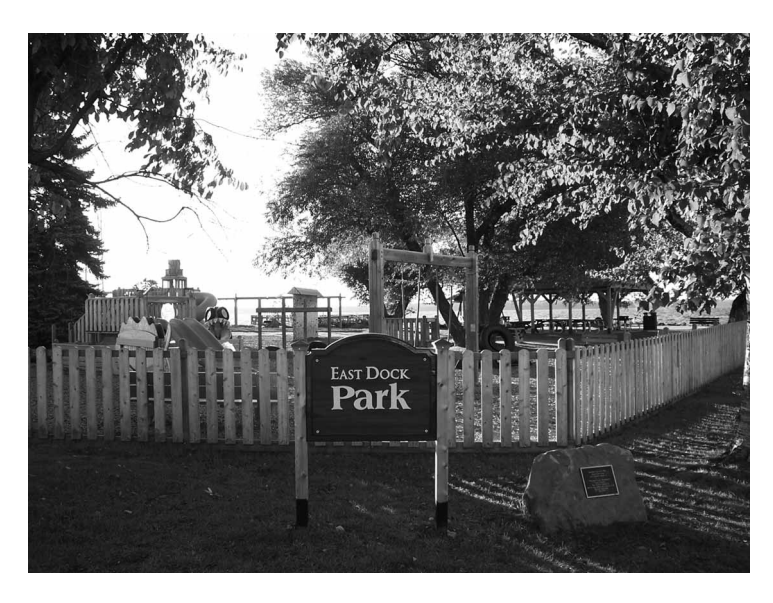
Figure 3. A product of communal efforts.

Vestiges of traditional economies and landscapes, as well as historical buildings and cultural amenities, form another category of photos commonly presented in both areas, as demonstrated in Figures 4 and 5.