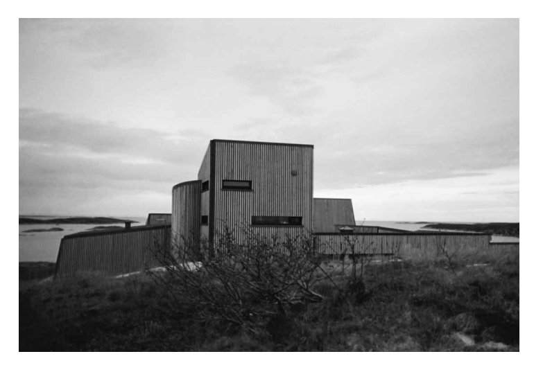
Figure 7. New seasonal home built upon the island's "best view".

Floyd 2004). Photos did, however, also facilitate discussion of issues of concern, as alluded to above. In Norway, numerous participants took photos meant to signify two controversial local issues: a proposed wind park and seasonal homes built within the national coastline protection zone, within which homes are not to be constructed. For example, according to the upper-middle-class participant who took the photo presented as Figure 7, this new seasonal home upon the island's "best view" does not fit into the local landscape and dwarfs neighbouring homes. She could not understand the lack of regard for neighbours – who frequently gathered on the property to picnic and enjoy the view of the sea – and local history or why the new home was allowed to be placed so close to the shore.