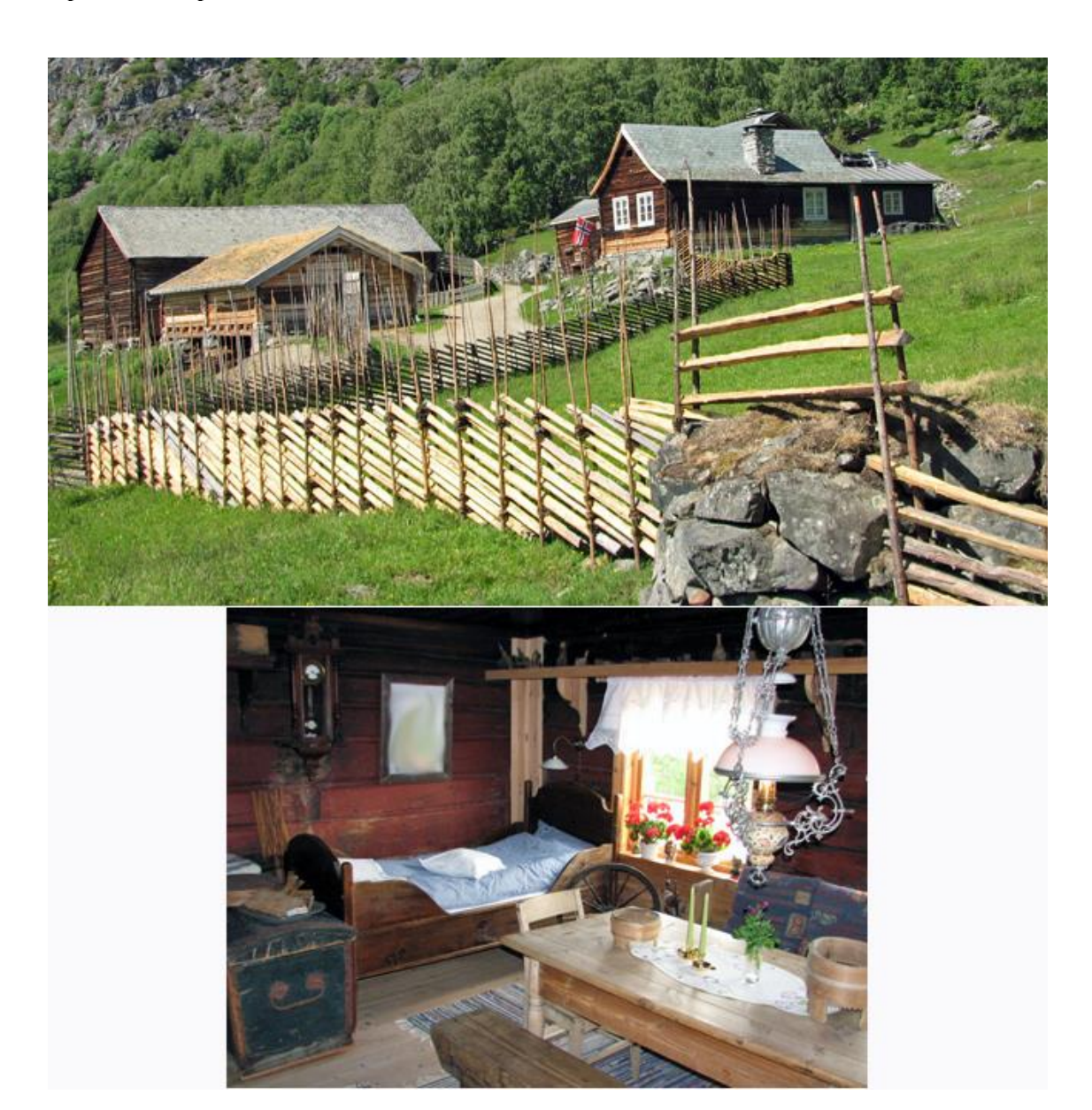
Figure 3. Heritage Farm

This version is "author's accepted manuscript". Contact author directly for a citable version