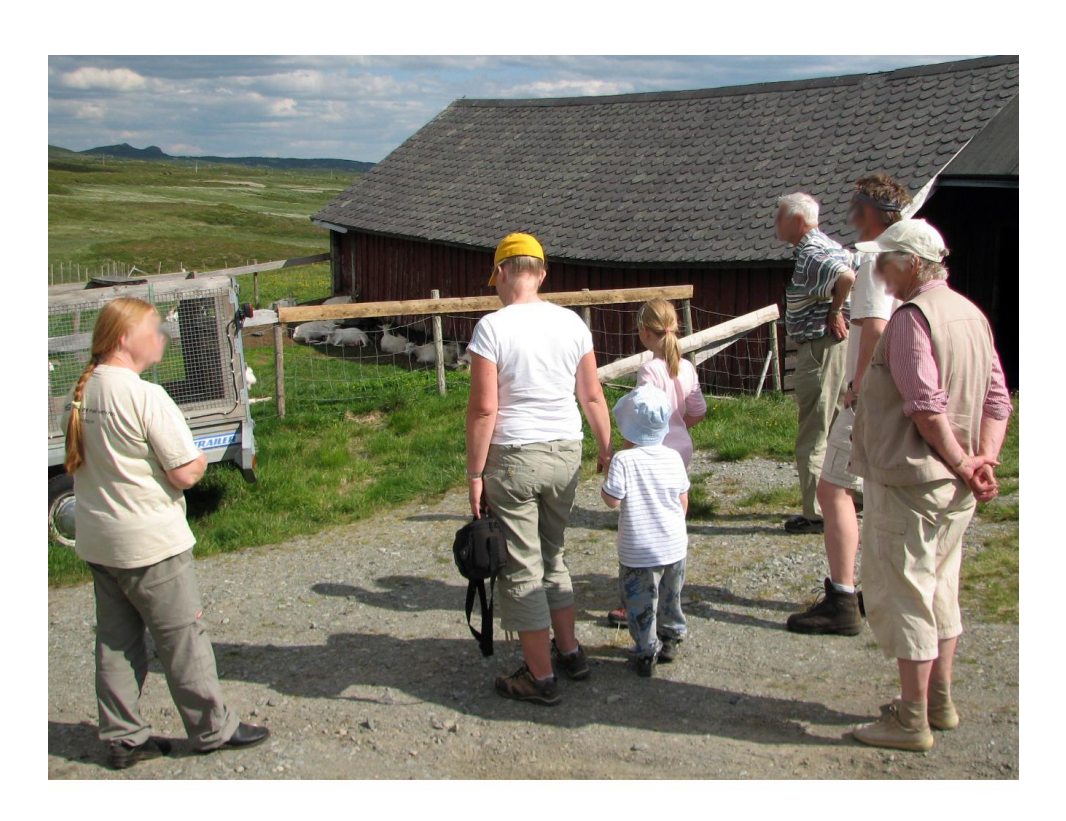
Figure 2. Goat Farm

This version is "author's accepted manuscript". Contact author directly for a citable version