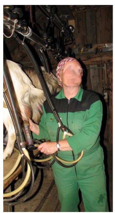
Figure 7. Examples of performativity at Goat Farm

This version is "author's accepted manuscript". Contact author directly for a citable version