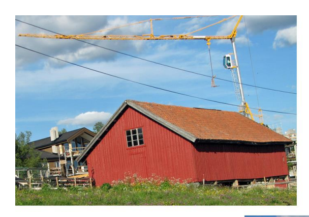
Figure 6. Display Farm's surroundings of urban sprawl

This version is "author's accepted manuscript". Contact author directly for a citable version