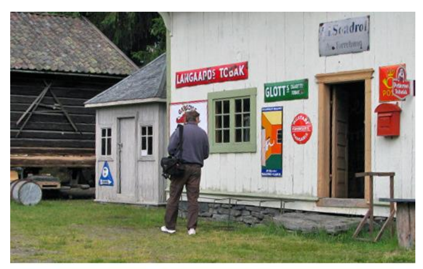
Figure 4. The Folk Museum

This version is "author's accepted manuscript". Contact author directly for a citable version