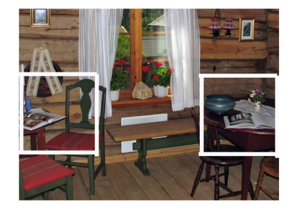
Figure 5. Examples of the deployment of cool authentication at Heritage Farm

© 2013. This manuscript version is made available under the CC-BY-NC-ND 4.0 license http://creativecommons.org/licenses/by-nc-nd/4.0/