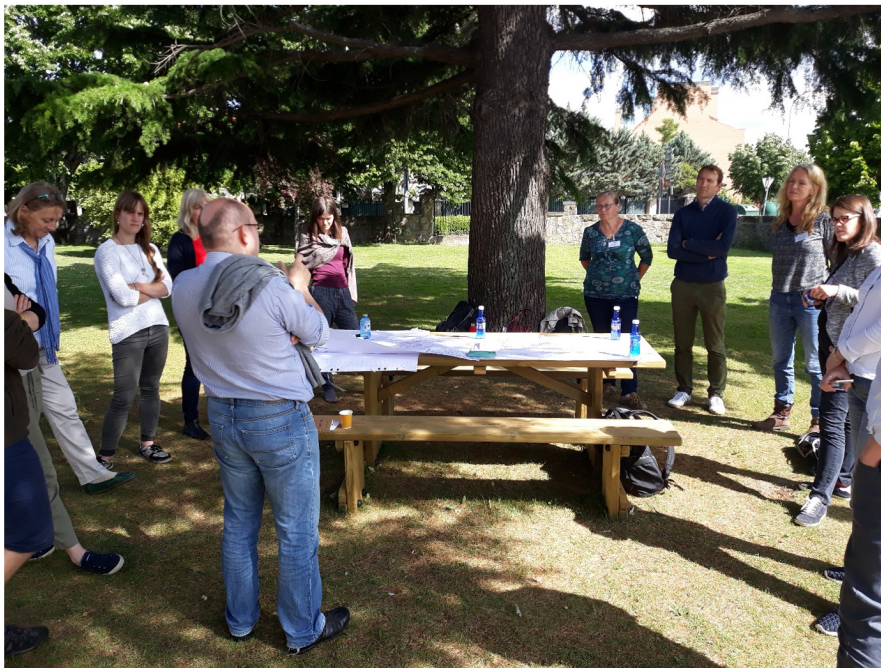
Reflection session between different Living Labs, where facilitators and monitors explore and discuss the conditions that influence the functioning of their Living Lab.

tool to create awareness of a farmer's own influence on water quality. Second, complexity stems from differences in ideas about viable solutions or the criteria to assess the solutions. Third, complexity can also originate from a gap or friction between the challenge in the Lab and the private interest of the end users, as already noted in the example of the Norwegian Living Lab. These are more complex challenges than solving an individual farmer's technical problem.