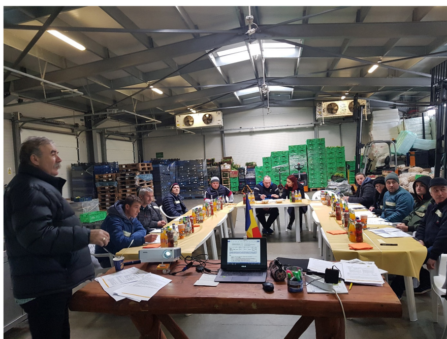
Living Lab event in Romania, where the members of a farmers’ cooperative discuss fiscal and financial information needs with fiscal advisors

Another key contribution of AgriLink Living Labs to the development of the AKIS stems from new collaborative practices. For each sustainability challenge the most relevant farmers,