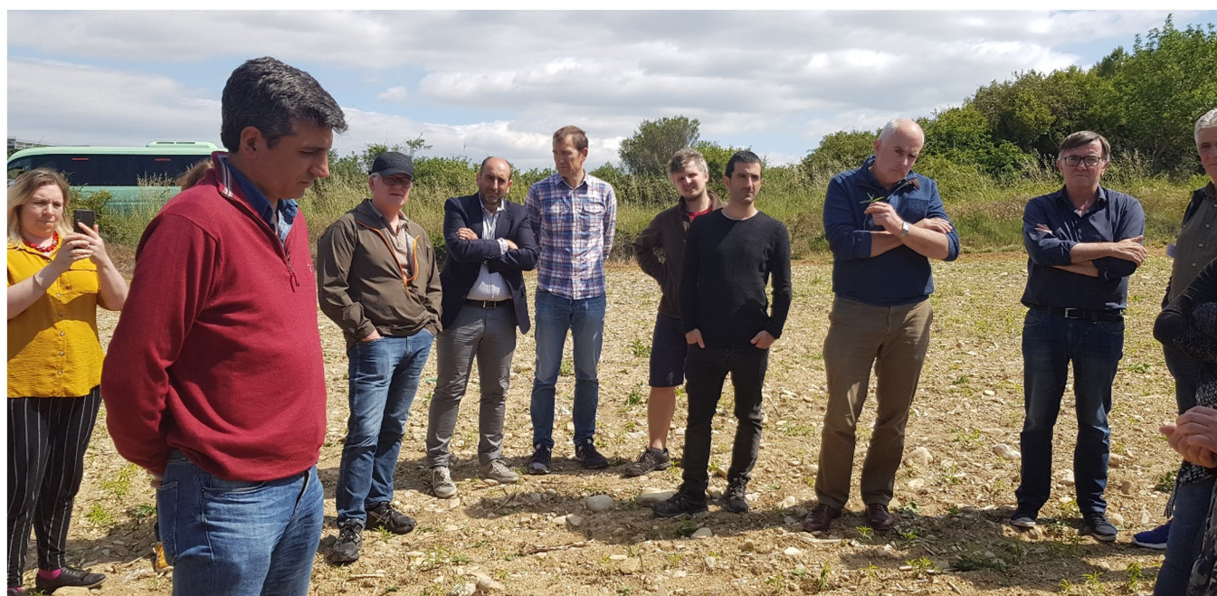
Field visit in the Spanish Living Lab in Navarra, where farmers discuss their experiences with the early warning system for integrated pest management.

Living Labs require significant resources and a nascent group of dedicated actors, so are best used for complex challenges which require the interaction and knowledge of multiple actors to address a given policy objective. There are three distinct but interconnected aspects to consider when assessing the complexity. The first aspect is the level of agreement between the actors involved about the direction of development. For example, in the Dutch Living Lab the challenge was complex because some stakeholders thought maize production could continue unchanged, while others saw a necessity to develop new practices. In response the actors in the Living Lab developed a practical procedure for water sampling at farm level, as an advisory