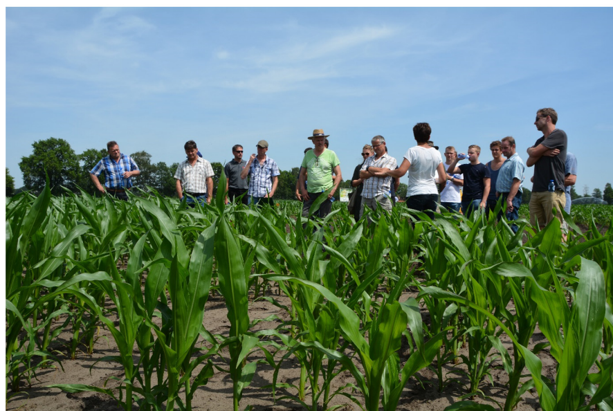
Field visit in the Dutch/Belgian Living Lab, where farmers compare the performance of different systems for maize cultivation.

should only be done when the cost of failure is acceptable, when there is room for unanticipated outputs arising from the co-creation process, and when stakeholders or partner projects are willing and able to provide the necessary commitment. If these conditions are not met or are largely absent, time and effort is needed to create more supportive circumstances, or there should be serious questions asked about whether to start a Living Lab at all. Policymakers can play a crucial role in creating a more enabling setting by ensuring inclusiveness, creating spaces for dialogue, and securing funding or creating funding procedures which do not require predetermination of all outputs in detail. Further, it helps if policymakers coordinate action and agree on clear long-term policy directions to reach societal objectives. If not already in place a Living Lab can provide a space for the dialogue between policymakers and other involved actors about the policy direction, and to coordinate action. In AgriLink the Spanish publicly funded advisory organisation in Navarra provided an enabling setting for the Living Lab and facilitated the adoption of the lessons learned in the AKIS. By working closely with Living Labs, policymakers can take an enabling role in adapting regulations, creating instruments, or support capacity building and training that will help scale-up and deploy the innovations that have been developed in the Living Labs.