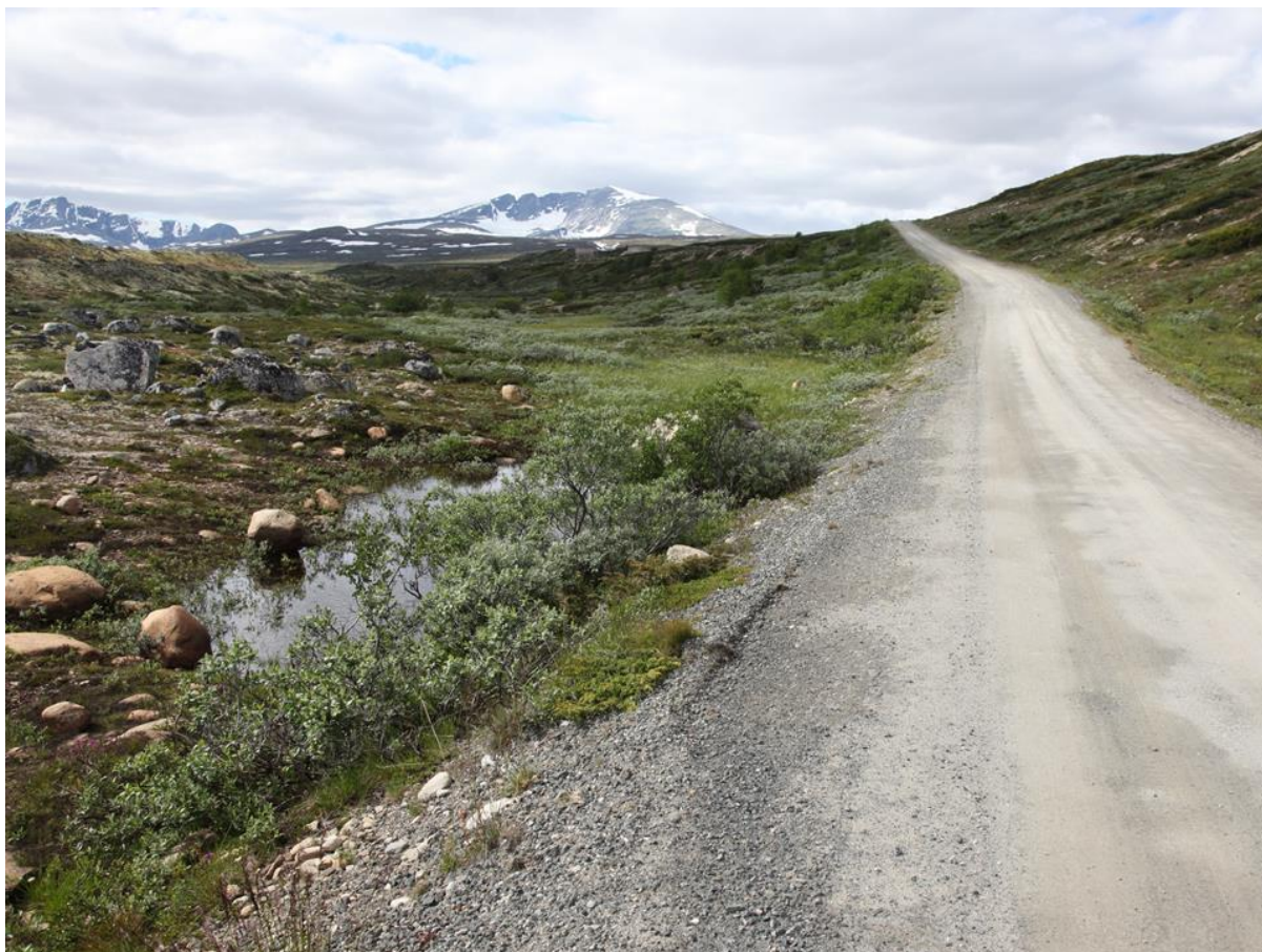
Figure 2. The road to Snøheim in Dovrefjell (looking north-west), with Snøhetta in the background (Photo: Vegard Gundersen, 2015).